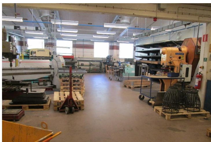
Welding workshop at Mariefred prison

Perhaps the most impressive feature at Mariefred was training offered to foreign prisoners. Since 2014 foreign prisoners can learn how to weld iron in a new training workshop. Welding, Mohammed says, is a skill that can be used wherever a prisoner goes back to. 'I'm from Africa myself. I remember people building gates, building beds, making buckets for water, pans for cooking, repairing cars. These skills are still needed in Africa, South America and in Eastern Europe. I had a post card the other day from a prisoner who's back in Gambia and just about to open his own business. He can do something that will keep him out of prison'. The training course lasts four months; those who complete the course receive a certificate and can then work to produce fire baskets which are sold locally.