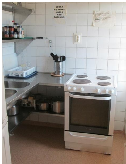
Kitchen in Pavilion 2, Mariefred prison