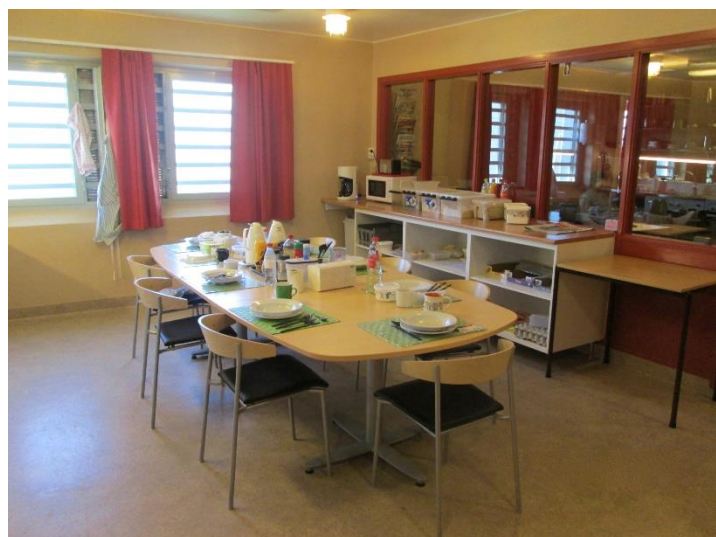
Table set for evening meal, Mariefred prison

Prisoners had in-cell television with a choice of 25 television channels including foreign language channel, CNN, BBC, Al Jazeera and a sports and film channel. The channel choice is reviewed every six months and then adapted to the population. Every weekend three foreign language films are selected which can be watched individually or as a communal activity.