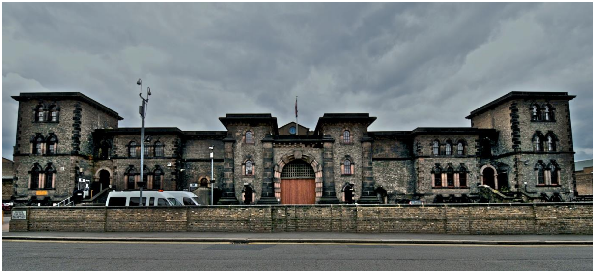
HMP Wandsworth, London

HMP Wandsworth in south London is a Victorian Cat B local prison. It holds around 1,630 male prisoners, more than any other prison in UK. It is unacceptably crowded. Prisoners live in shared cells which are cramped. The population is typical of other inner city local prisons; there is a high incidence of mental health problems and substance misuse. The prison, which serves the London courts, is busy. There are 2,000 prisoner movements through reception each month 2 .